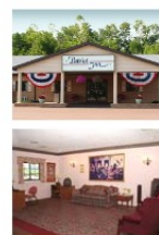
Budget Host Patriot Inn

For information on availability, rates, and amenities, click on the rotating pictures of the following establishments.